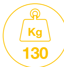
Portata Weight capacity