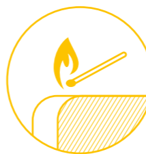
Omologata ignifuga Approved version fire retardant