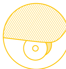
Roller Roller system