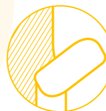
Bracciolo pieghevole Folding armrest